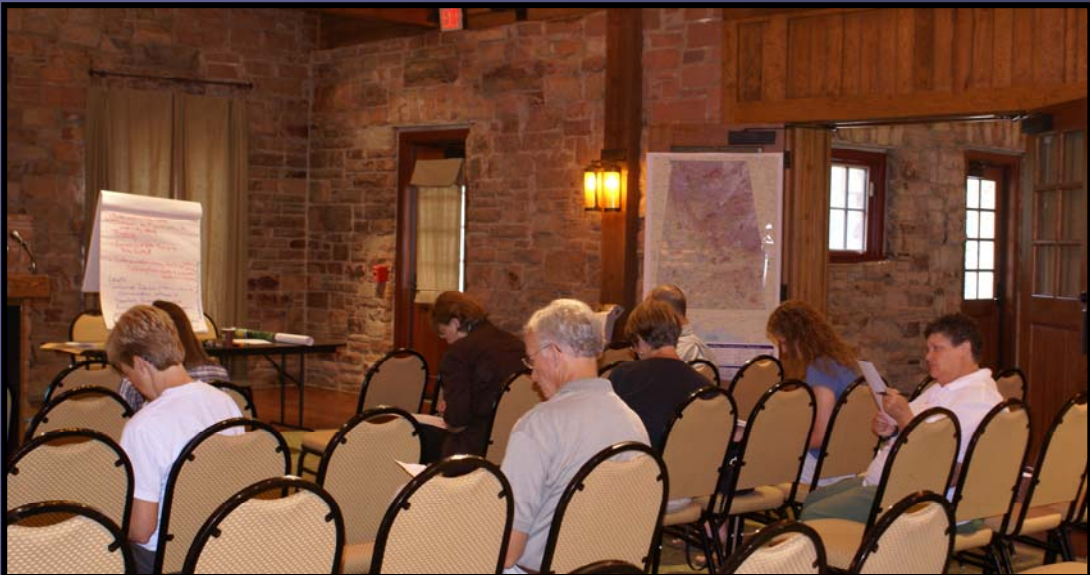
Stakeholders complete comment forms at the Monte Sano SCORP and Trail Plan Public Meeting